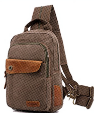
SMALL BAGS MEASURING LESS THAN 14" X 11" X 5"