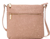
SMALL PURSE/CLUTCH BAG