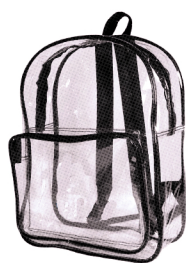
ANY BAG MADE OF CLEAR PLASTIC, CLEAR VINYL OR CLEAR PVC