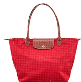
TOTE BAGS OR HOBO BAGS LARGER THAN 14" X 11" X 5"