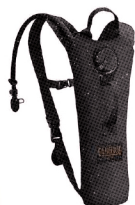
EMPTY HYDRATION PACK